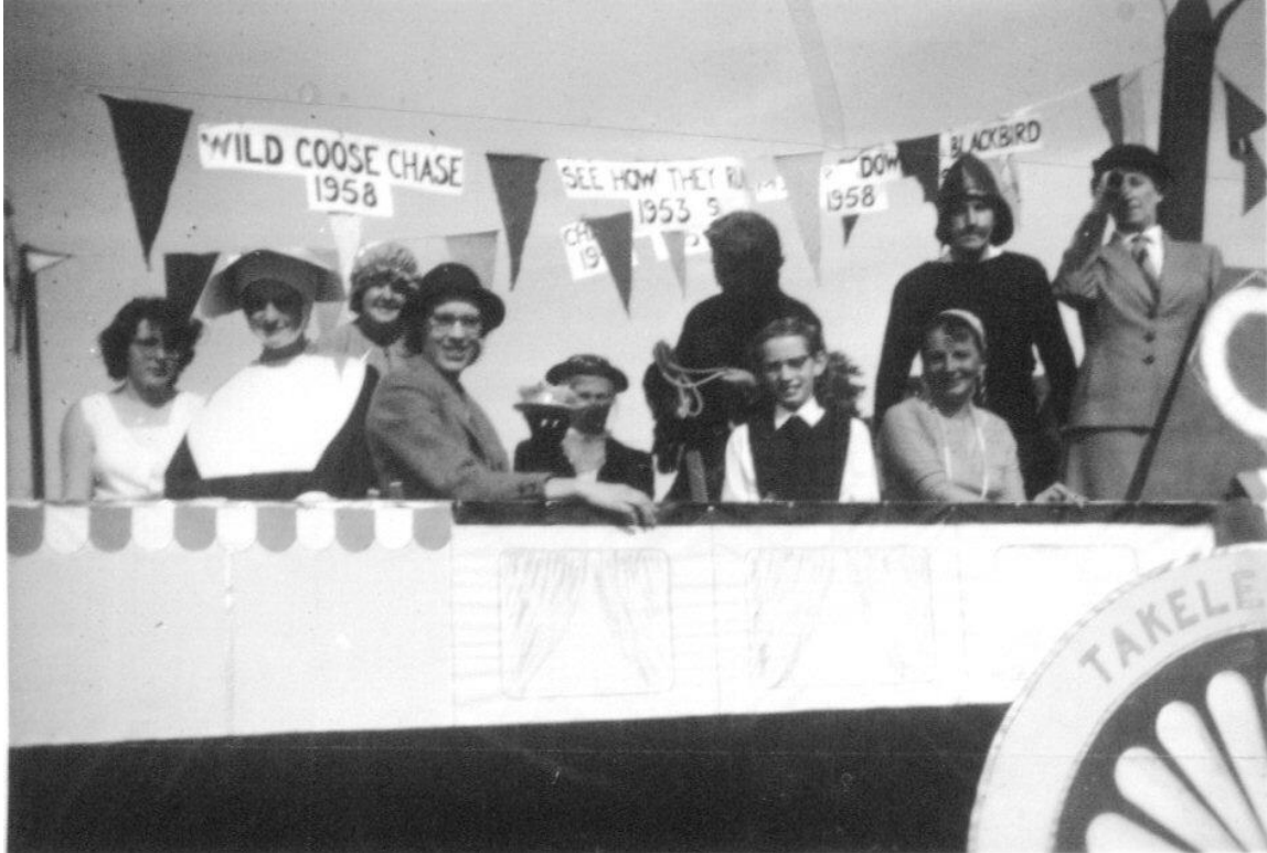
Takeley Players Carnival Float in the late 1950s

There follows about 70 photographs which have been grouped by production by comparing scenery and costumes.